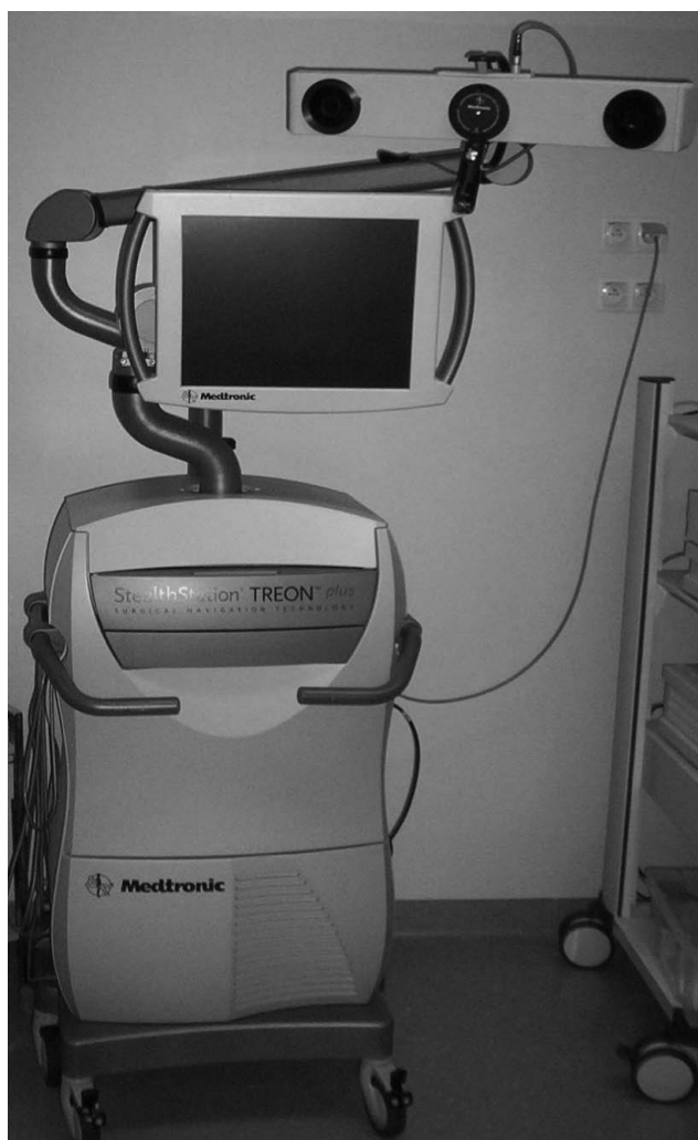
Fig. 2. Intra-operative navigation.