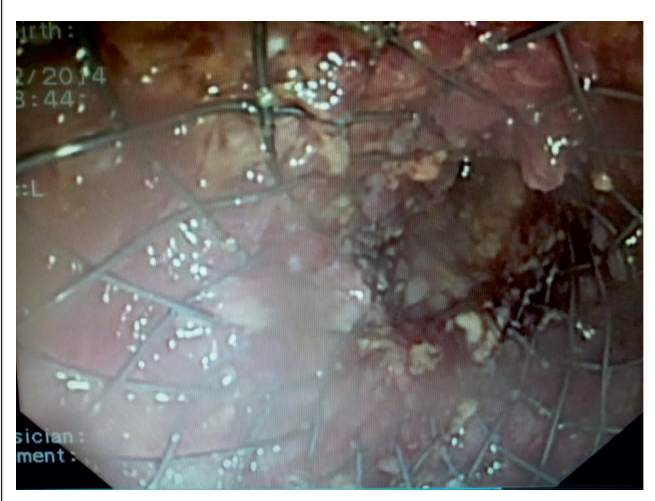
Fig. 3. Self-expanding metallic stent.

Up to 29% patients with colorectal cancer present symptoms of bowel obstruction such as: vomiting and abdominal pain (1). Due to age, serious multiple comorbidities and metastatic disease, colonic stenting is safe and effective alternative approach for palliation (3). These patients are in poor medical condition and need emergency decompression of the colon. Emergent surgical decompression results are poor with high mortality