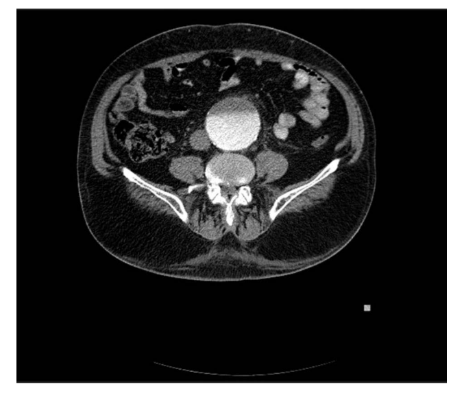
Fig. 2. A 76-year-old Caucasian man with the abdominal aorta aneurysm diameter 70 x 74 millimeters.

chronic disease patient was disqualified from surgery and chemotherapy.