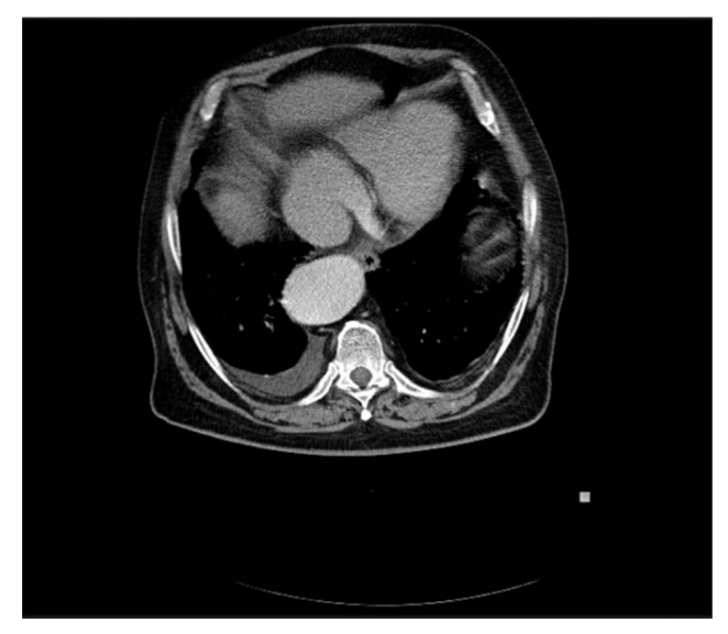
Fig. 1. A 76-year-old Caucasian man with the ascending aorta aneurysm diameter to 50 millimeters.

The patient was consulted by the oncologist, the surgeon oncologist, the vascular surgeon and the anesthesiologist. Because of the patient's general condition and